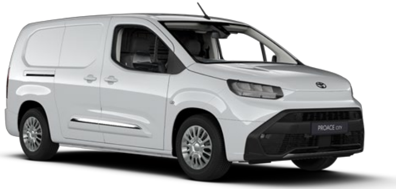
Icy White (EPR)