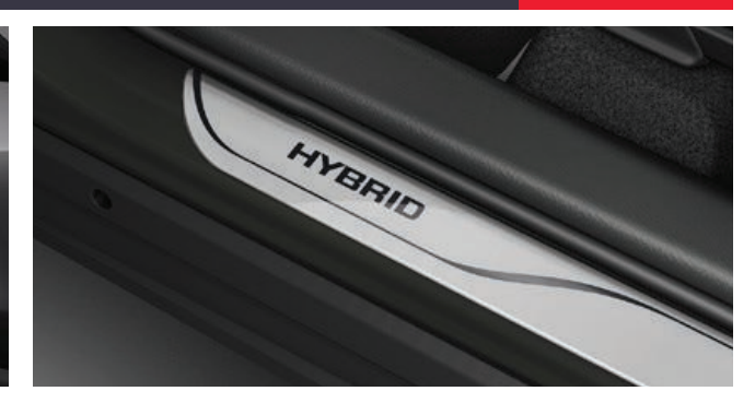
ALUMINIUM SCUFF PLATES Genuine scu "pla tes for the door sills create an immediate impression of style while also serving a very practical purpose of protecting the sill paintwork.