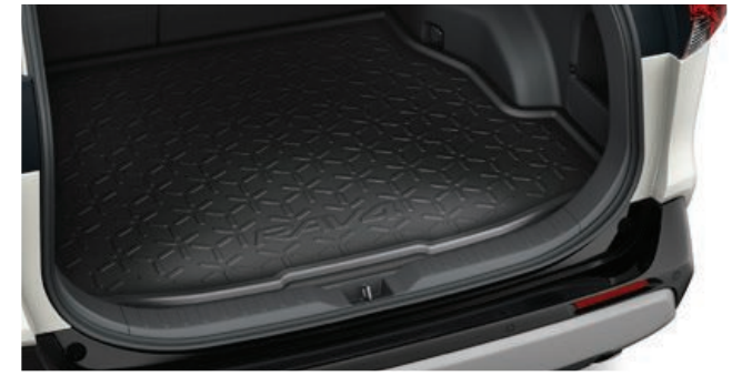
BOOT LINER Tailored to ÿt the boot of your vehicle and provide protection against dirt and spills.