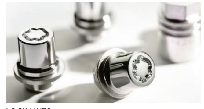
LOCK NUTS Replacing one nut on each wheel with a Toyota hardened steel wheel lock will maximise security for your valuable alloys.