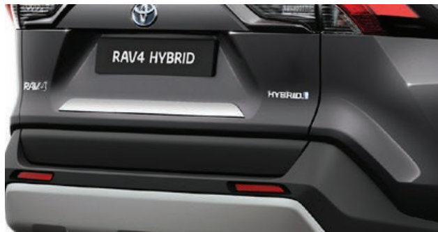
REAR GARNISH With a smart chrome ÿnish to add an extra element of style to your car's boot.