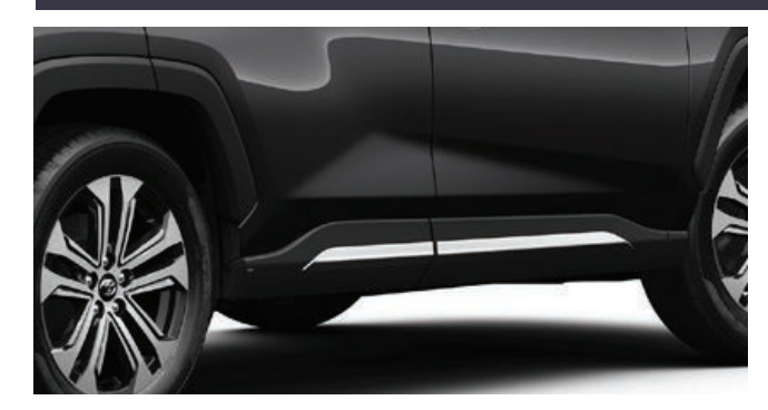
SIDE CHROME GARNISH Contoured to integrate smoothly with the side of your car and create a powerful low proÿle appearance.