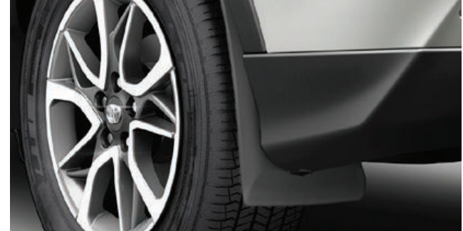
FRONT & REAR MUD GUARDS* Designed to minimise water, mud and stones spraying onto your car's body. *Cannot be fitted in conjunction with side steps.