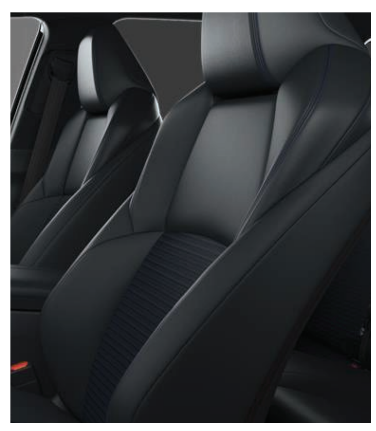
Black Fabric Upholstery with grey stitching (Luna) Black Synthetic Leather Upholstery with grey stitching (Sol) Black Synthetic Leather Upholstery with blue stitching (Sport) Full (Black/Beige) Smooth Leather Upholstery with grey stitching (Platinum)

Available in black fabric or synthetic leather with a unified black instrument panel that delivers a fresh image.