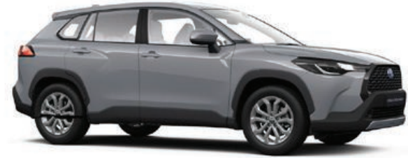
Manhattan Grey** (1H5)