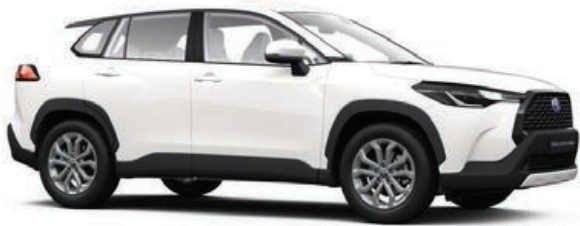
Pure White* (040)