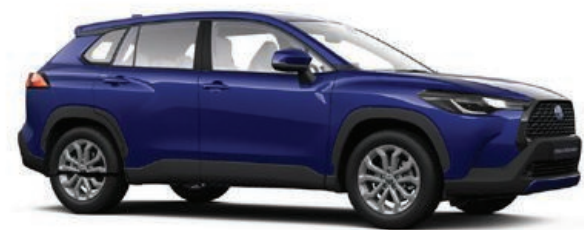
Cobalt Blue** (8W7)