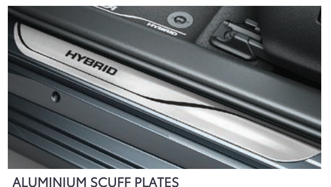
Genuine scuff impression of style while also serving a very practical purpose of plates for the door sills create an immediate protecting the sill paintwork.