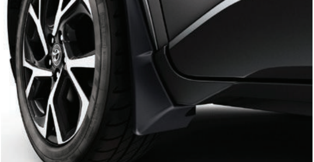
FRONT & REAR MUD GUARDS Designed to minimise water, mud and stones spraying onto your car's body.

Designed to protect the rear bumper paintwork against scratching when sliding heavy or awkward loads into the boot. It is also particularly effective for guarding the paintwork of the boot area.