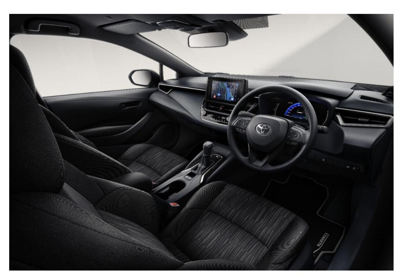
Black Fabric with Grey Stitching