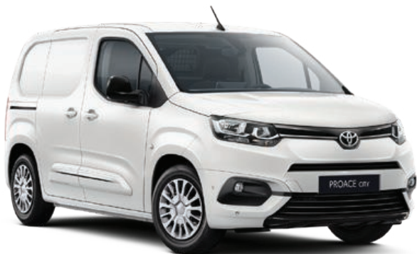
Icy White (EPR)