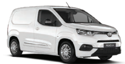
GX-Camera & Colour Pack