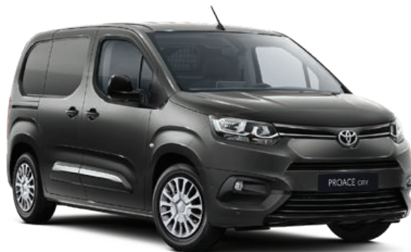
Dark Grey (EVL)