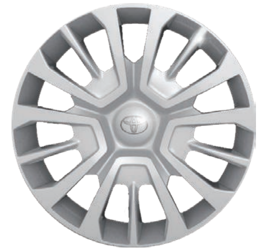
GX-Camera & Colour Pack