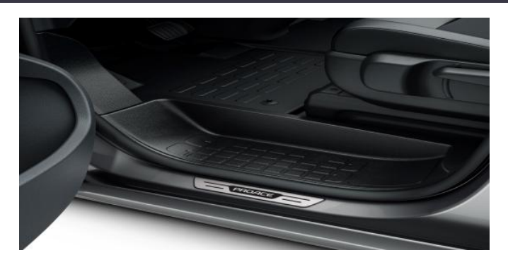
ALUMINIUM SCUFF PLATES

Genuine scuff plates for the door sills create an immediate impression of style while also serving a very practical purpose of protecting the sill paintwork