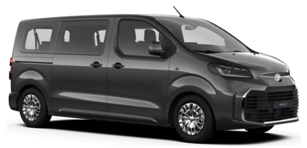
Titanium Grey (KKJ)