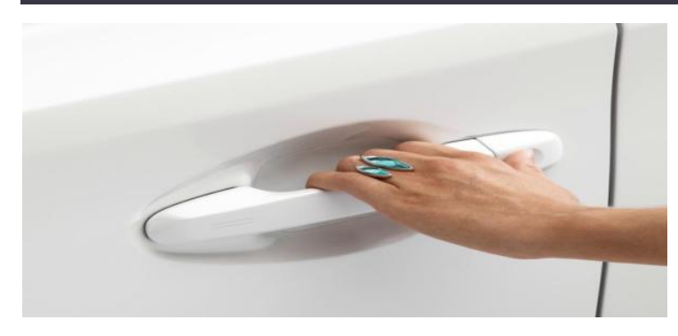
DOOR HANDLE PROTECTION FILM The door handle protection film is a tough transparent self-adhesive film that helps protect door paintwork against those small scrapes and scratches