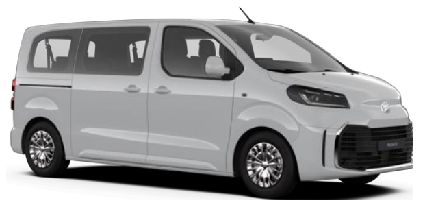
Icy White (EPR)