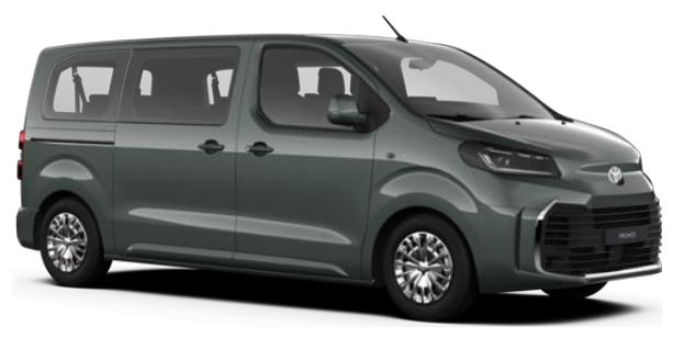
Green Velvet (EDU)