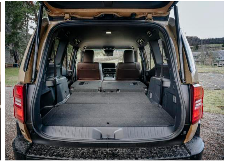
Black leather or Chestnut leather upholstery (First Edition)