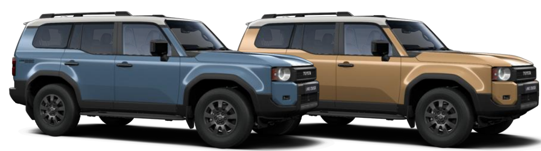
Smokey Blue Bi-tone (2ZD)