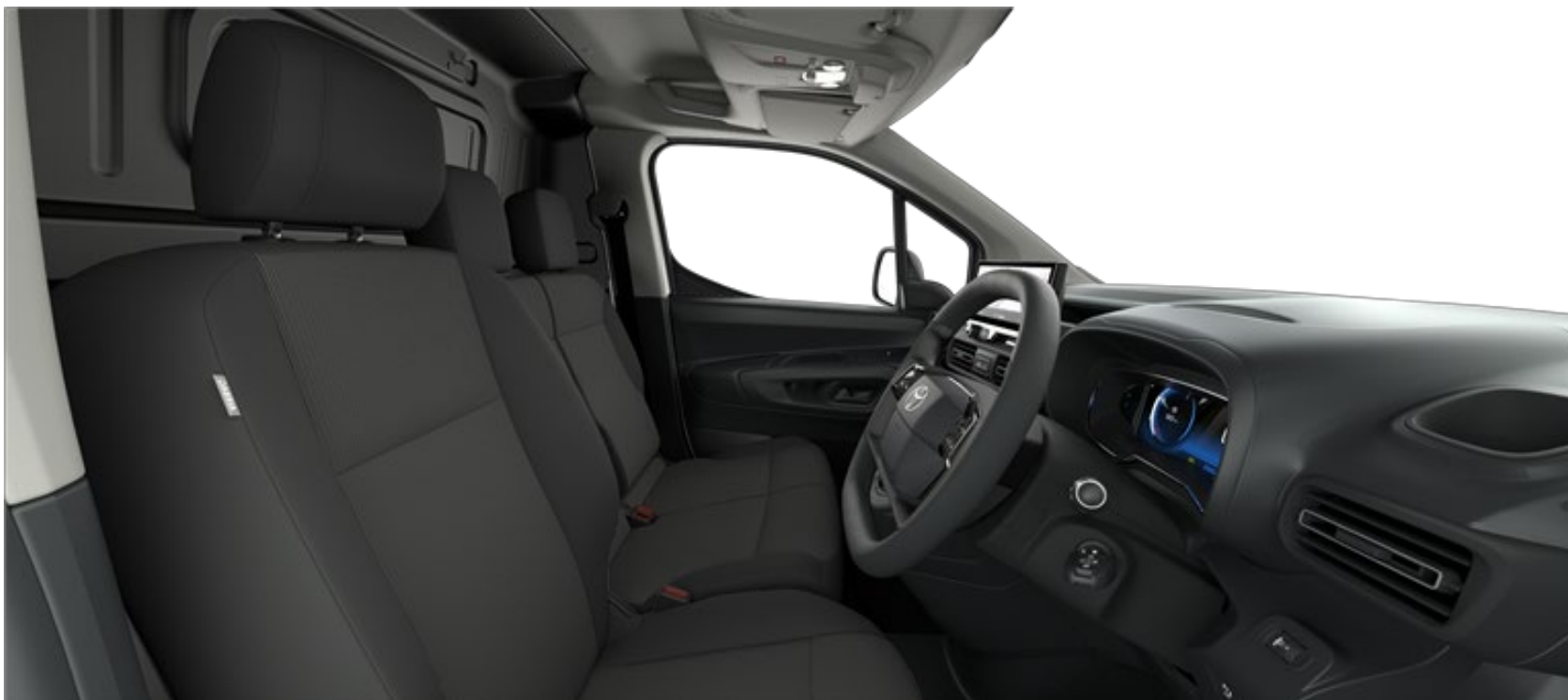
Grey fabric (CMFY)

Available in grey fabric with a unified black instrument panel that delivers a fresh image.